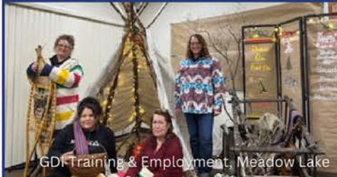
GDI Training & Employment, Meadow Lake