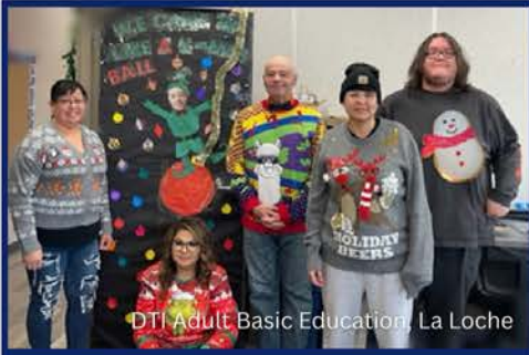
DTI Adult Basic Education, La Loche