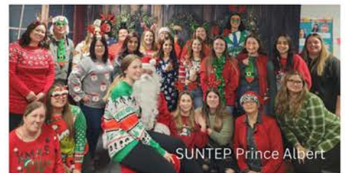
SUNTEP Prince Albert

Faculty and students at SUNTEP Prince Albert hope to be able to continue to expand the hamper program in coming years to bring joy and kindness to more schools and families in the city. 🌍