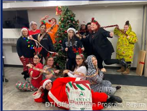
DTI Office Administration Program, Regina