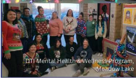
DTI Mental Health & Wellness Program, Meadow Lake