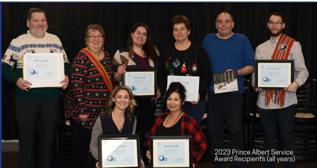
2023 Prince Albert Service Award Recipients (all years)

The GDI Communicator is an internal newsletter intended to document the achievements of management and staff of the Gabriel Dumont Institute of Native Studies and Applied Research