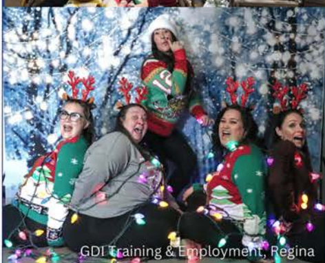
GDI Training & Employment, Regina